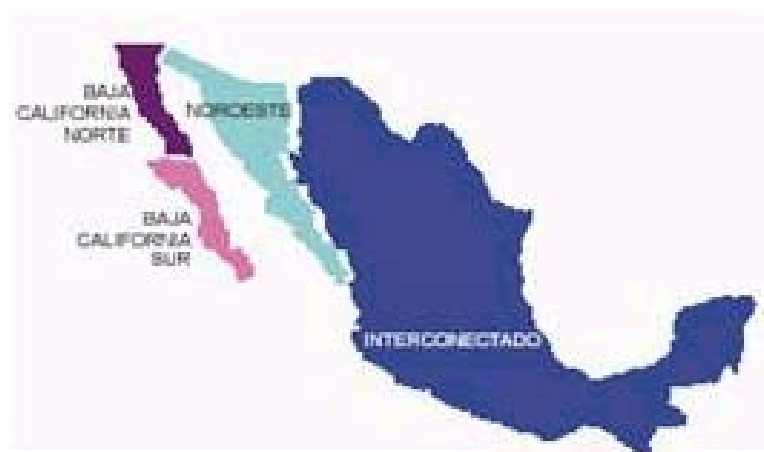
Figure 1: National Electrical Power System divided into systems

The interconnected system allows satisfaction of user demands through collective contributions by each region and, in principle, each power generating station that is part of the system contributes proportionately to each user's consumption. In this manner, it does not matter where geographically the user is located within the system, since all of the generating stations have the possibility of supplying any user. Annex 7 presents emission factors for estimating GHG inventories resulting from the purchase of electrical power.